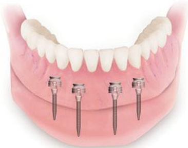
Denture is Removable