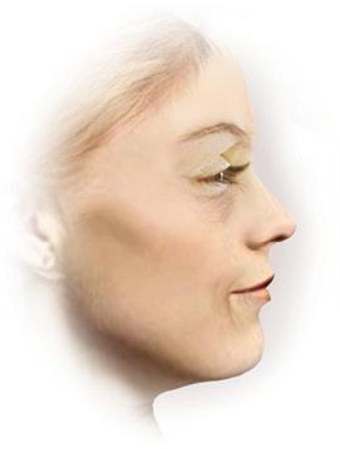
Facial appearance: healthy mandible

Bone loss not only causes loose dentures ... it causes a change in your appearance.