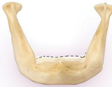
Mandible Shortly After Extraction (removal of natural teeth)