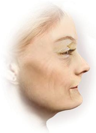
Appearance after loss of teeth