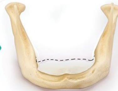
Eventual Bone Loss (resorption)