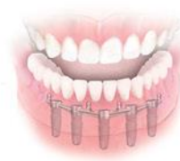
Full-Size Dental Implants

Your dentist can help determine what's best for you.