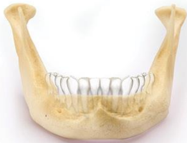
Healthy Mandible (lower jawbone)