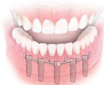
Removable Implant Denture