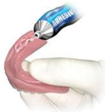
Denture Creams, Gels, etc. (e.g., Poligrip®)