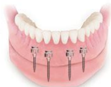
Mini Dental Implants