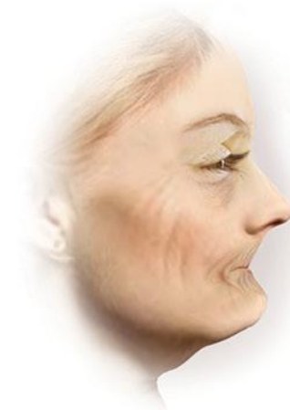
Appearance after loss of teeth and bone